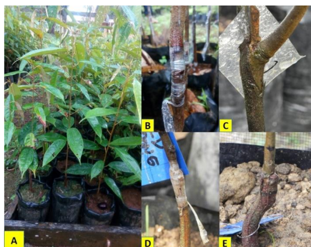
Fig 2. Chip budding and cleft grafting procedure. (A) Four-months-old seedlings plants for Rootstocks; (B) Chip budding graft made by inserting a bud chip to a transverse cut up in a rootstock stem; (C) Graft union occurring at chip budding system; (D) Cleft graft made by inserting a scion shoot to a longitudinal cut to form a V shape; (E) Graft union occurring at cleft grafting system.