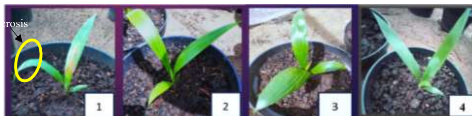
Fig 2. Plants infected with G. boninense ; the presence of symptoms of necrosis on leaves without bacterial application (1); there was no necrosis on the leaves where isolates H5 (2), F2 (3), and S2A (4) were applied to the growing media after 8 weeks.

One isolate from each peat maturity level was selected for the application test on oil palm seedlings exposed to G. boninense in pots, namely isolates S2A, H5, and F2. In this study, observations were conducted eight weeks after bacterial application to determine its effect. The results showed that no necrosis was observed in the leaves of oil palm seedlings after the application of S2A, H5, and F2 bacteria. However, necrosis symptoms did appear in seedlings that were not treated with bacteria, as shown in Figure 2. One of the early symptoms of G. boninense infection in oil palm seedlings is leaf necrosis. Further symptoms include stem rot and the appearance of G. boninense bodies. Although in vitro S2A bacteria have a low ability to inhibit the growth of G. boninense , the presence of S2A in the growth medium of oil palm seedlings infected with G. boninense can increase the resistance of seedlings to disease attacks. This may be due to other factors, such as the biofertilizer ability of the S2A isolate, which enables it to induce better seedling growth, thereby indirectly allowing the seedlings to survive disease attacks.