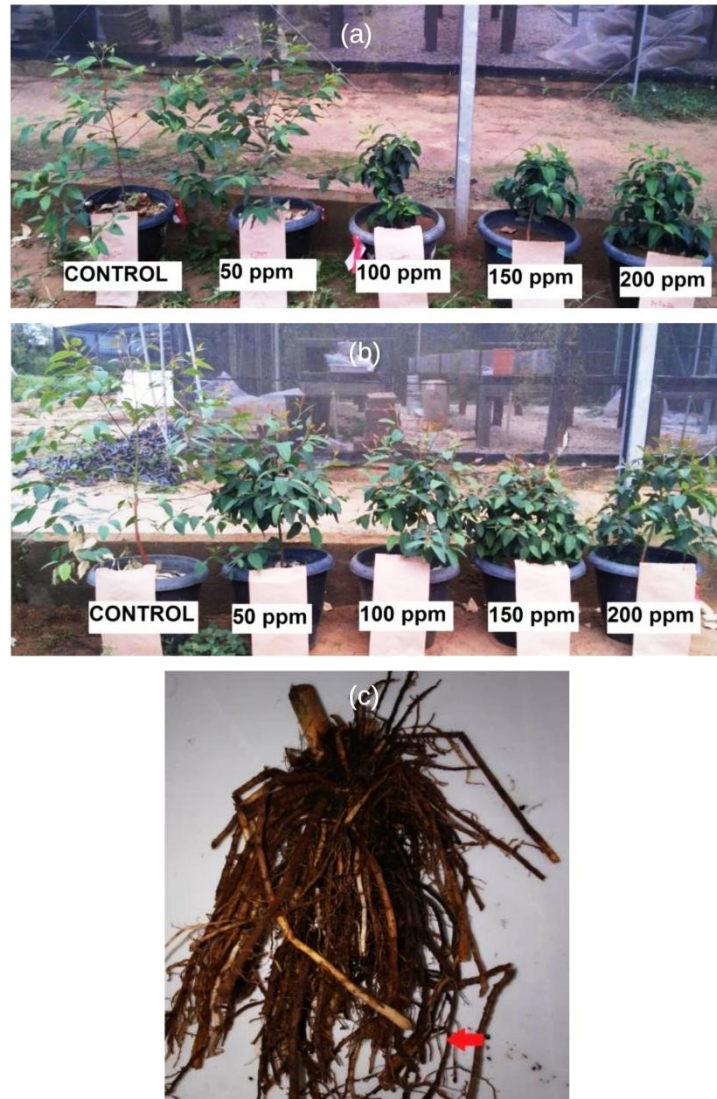
Supplementary Fig. 1. General comparative visual aspect of E. urophylla x E. grandis hybrid (AEC 1528) (a) and a spontaneous hybrid of E. urophylla (144 AEC) shoot (b) and roots (c) of submitted to PBZ concentrations of 0, 50, 100, 150 and 200 ppm a.i., applied via soil, at 90 days after treatment application.